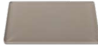
Mocha 6mm & 4mm