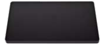
Carbon 6mm & 4mm

Due to the nature of computer screen calibration and the paper printing process, the colors and images depicted above may vary compared to the actual products' color and the results achieved. All images and colors are to be used as a guide only.