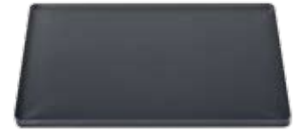
Steel 6mm & 4mm