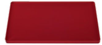
Grange 6mm & 4mm